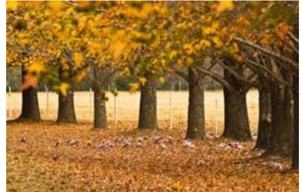
Camden Valley Way