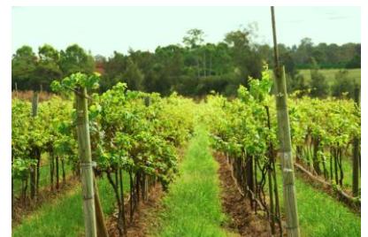
Fussy Grape Winery