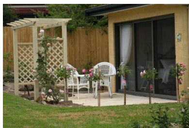
Garden Cottage B&B